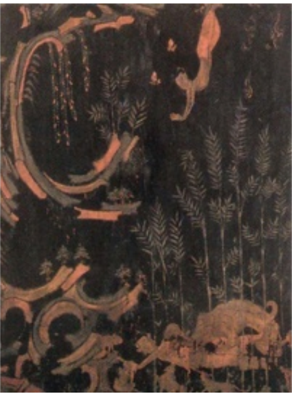
Left: Tamamushi no Zushi, Right: Shashin Shiko zu

If the voluntary death is to save others or to dedicate themselves to superior things, the actions of these Japanese are prone to be approved, yet charitably. Moreover, it is seen as a practice of the noble altruism, far from self-centeredness. It is defined as a glorious and benevolent self-sacrifice developed by the Bodhisatta Path from the Mahāyāna perspective. The sequent observation confirms that the irresolute and hesitant death is not ideal to the Japanese, but rather they prefer the mindful readiness for death when they think it is worthy. Such a determined will to the moment of death as "Isagi-yoku" as explained above, is seen influenced by the Japanese